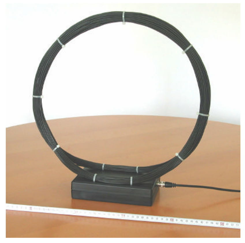
Figure 1. The prototype loop has 40 turns and a diameter of 38 cm.

between 30 and 100 ohms, however, the sensitivity was found to be insufficient for frequencies above 70 kHz, compared to my other active antennas, a Rohde & Schwarz HE-011, and a Wellbrook ALA1530 loop. For this reason, a slightly different design was chosen: Instead of using a "zero input impedance" amplifier, the loop is terminated by a load of a few kohms (the observed gain lack was not caused by the amplifier; the circuit used in the first tests had a flat frequency response up to well beyond 500 kHz).